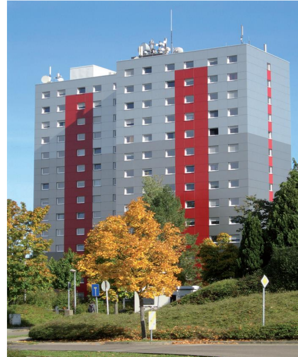
Students Hall of Residence