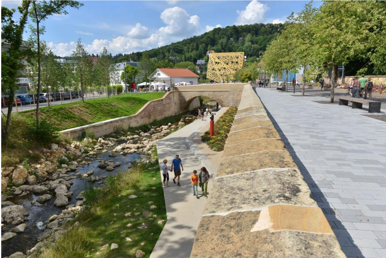
River Rems waterfront