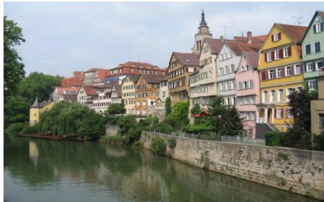
Trip to Tübingen